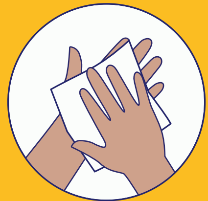
6. DRY HAND WITH TOWEL