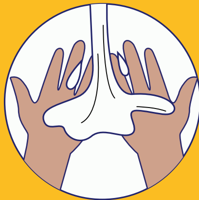
5. RINSE HANDS WITH WATER