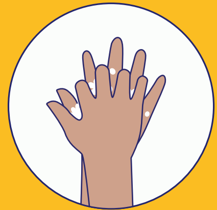
3. SCRUB BETWEEN YOUR FINGERS