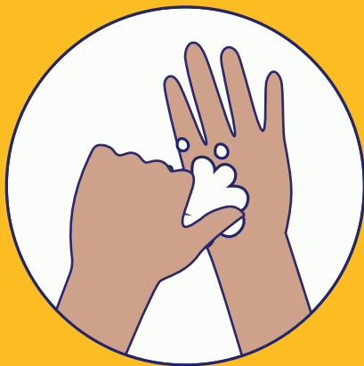
4. CLEAN BASE OF THUMBS