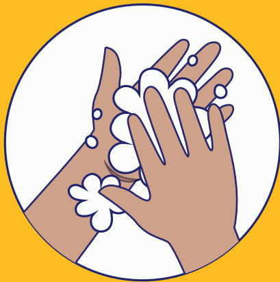
1. WET HANDS AND APPLY SOAP