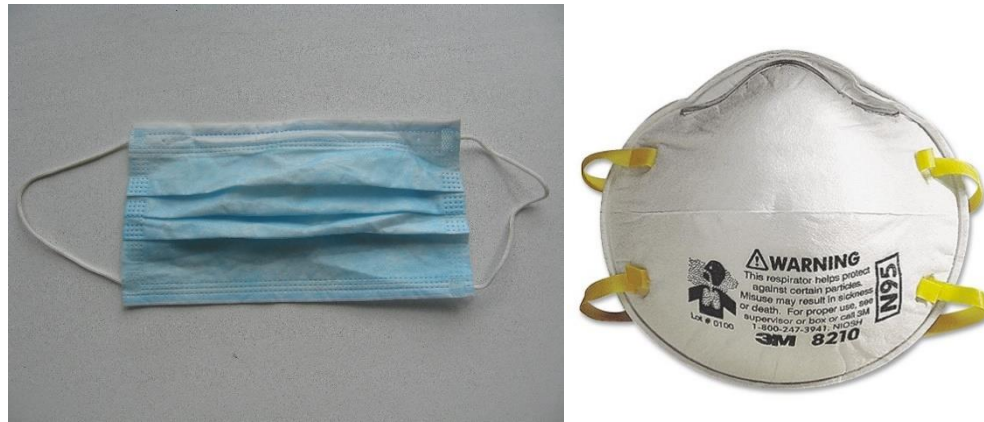
Surgical/procedure mask. Right: N95 respirator