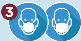
Put on Surgical/Procedural Mask or N95 Respirator and Perform Seal Check