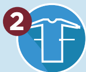
Put on Gown