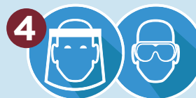
Put on Eye Protection