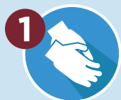
Perform Hand Hygiene

Regular training and monitoring on the use of mask, respirators and other PPE is critical to ensure measure and procedures are followed consistently and to maintain worker health and safety.