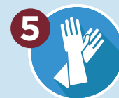
Put on Gloves